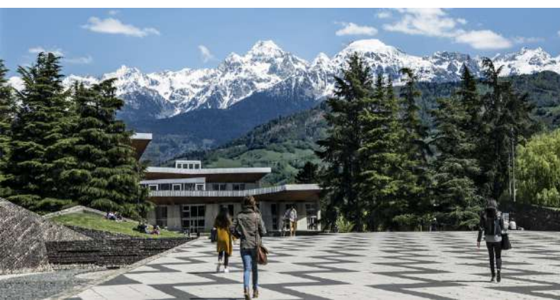
CAMPUS DE GRENOBLE